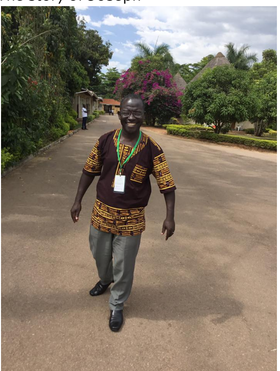
The story of Joseph