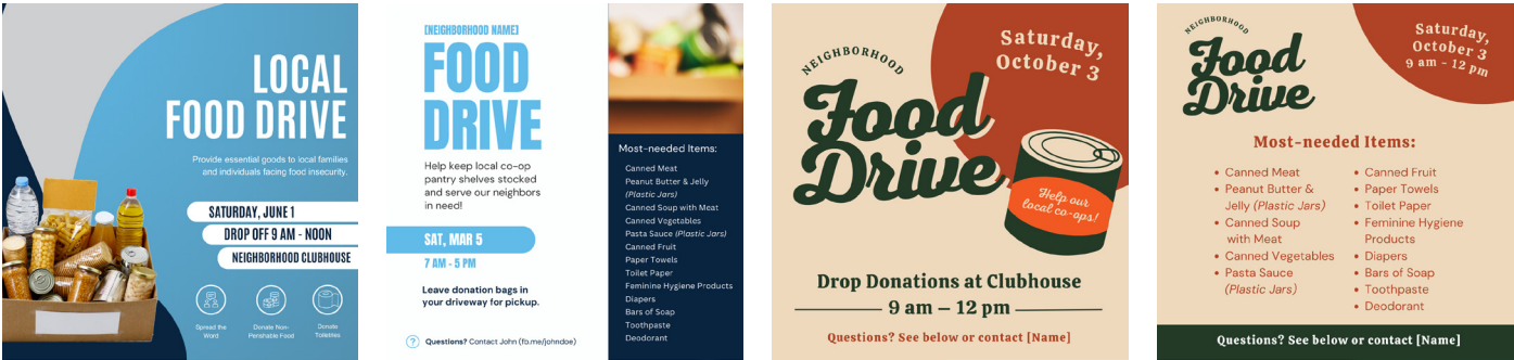
Sample Carousel Post (2 images)

To access these Canva templates, visit perimeter.org/FoodDriveSocial . (A free Canva account is required.)