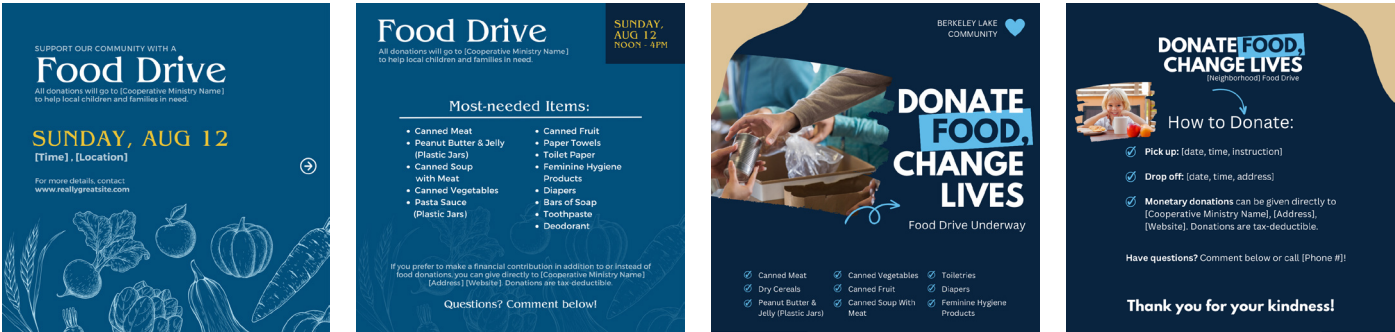
Sample Carousel Post (2 images)